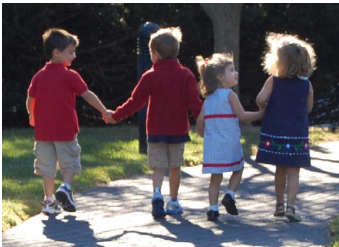
CCEP First Day