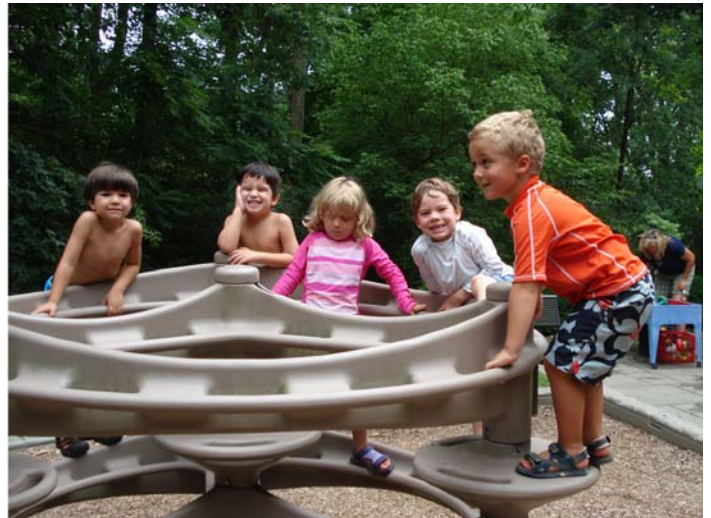
CCEP Summer Camp